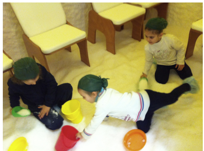
Fig. 2. “Aerosal ® ” Halotherapy Salt Room where children are always highly compliant as they consider treatment sessions as opportunities for play and recreation. ENT Care Unit–University General Hospital – Bari (Italy).

After collection of medical history, all the patients underwent clinical and instrumental exams as follows: ENT visit with inspection of the oropharyngeal tract and tonsillar hypertrophy staging (0°–4°) [27], flexible fibroscope nasal endoscopy (ENT 2000